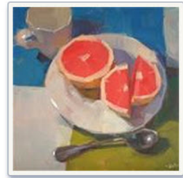
Grapefruit Diet $34 (out of stock)