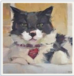
Marmelade Cat $200 (reproduction)