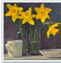
A Beautiful Life $100 (reproduction)