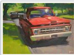
Red Truck $10 (reproduction)