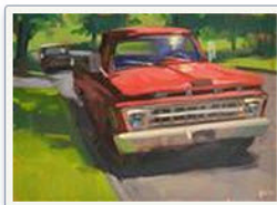
Red Truck $10 (reproduction)